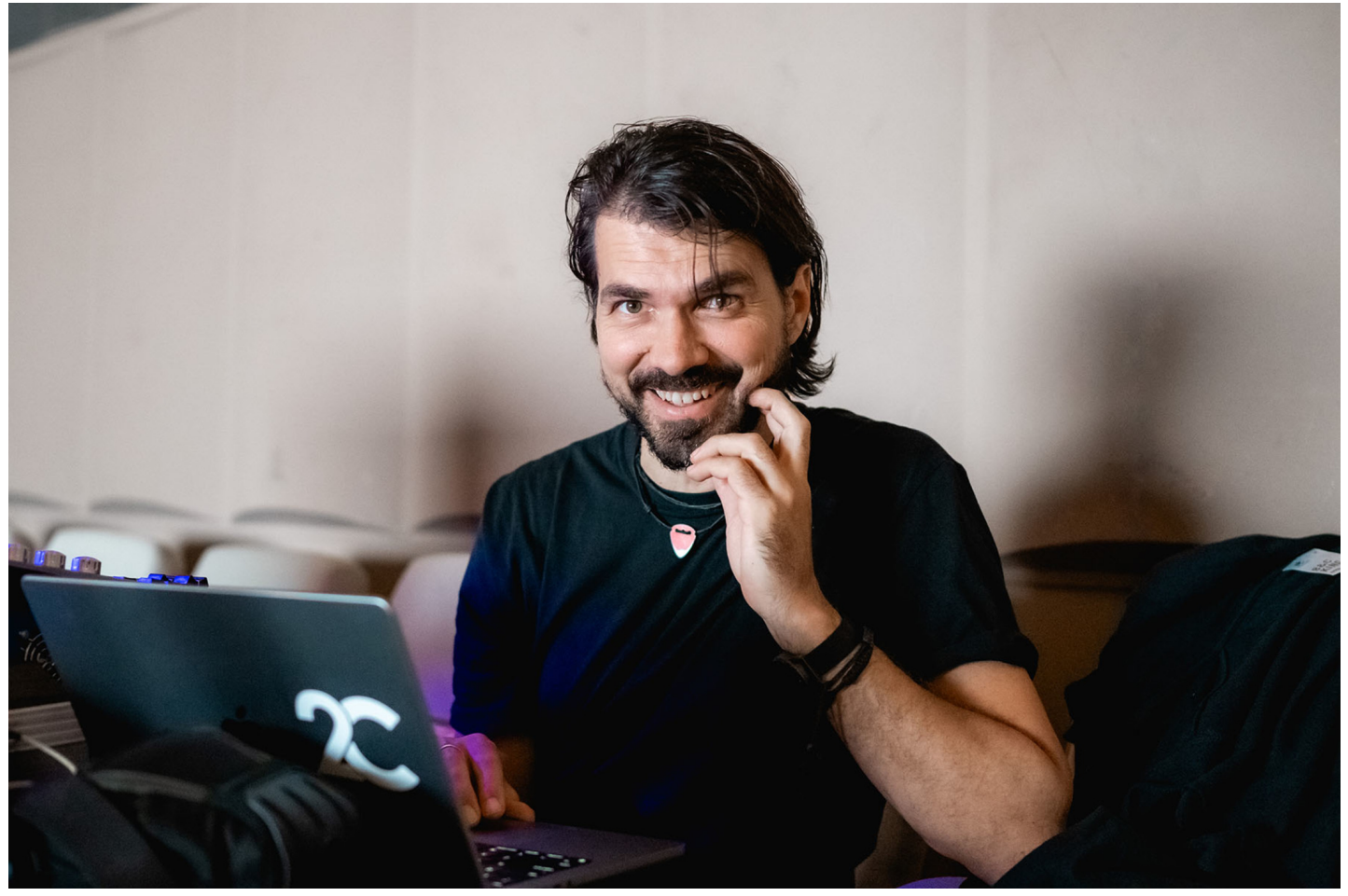
Robe Helps Perpetuum Celebrate 40 at Ljubljana's Cankarjev Dom